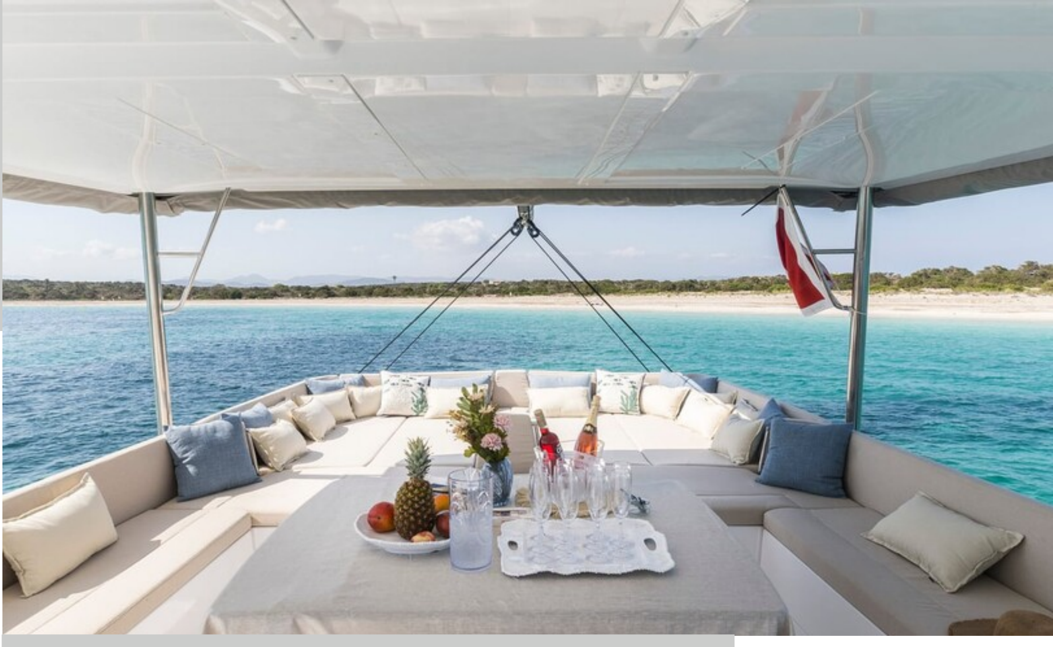
ALISEI BALI CATAMARANS