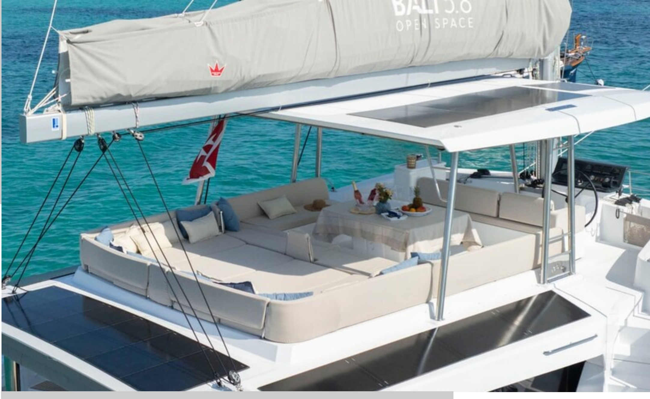
ALISEI BALI CATAMARANS