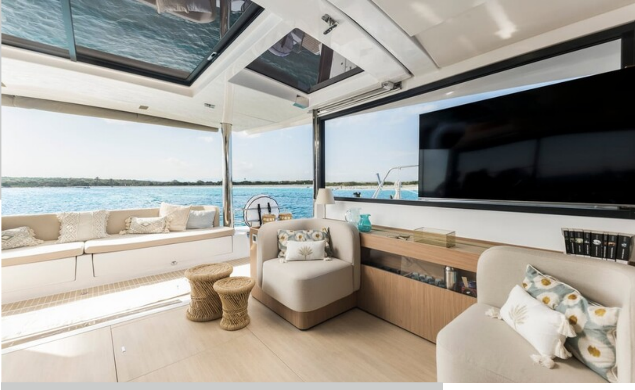
ALISEI BALI CATAMARANS