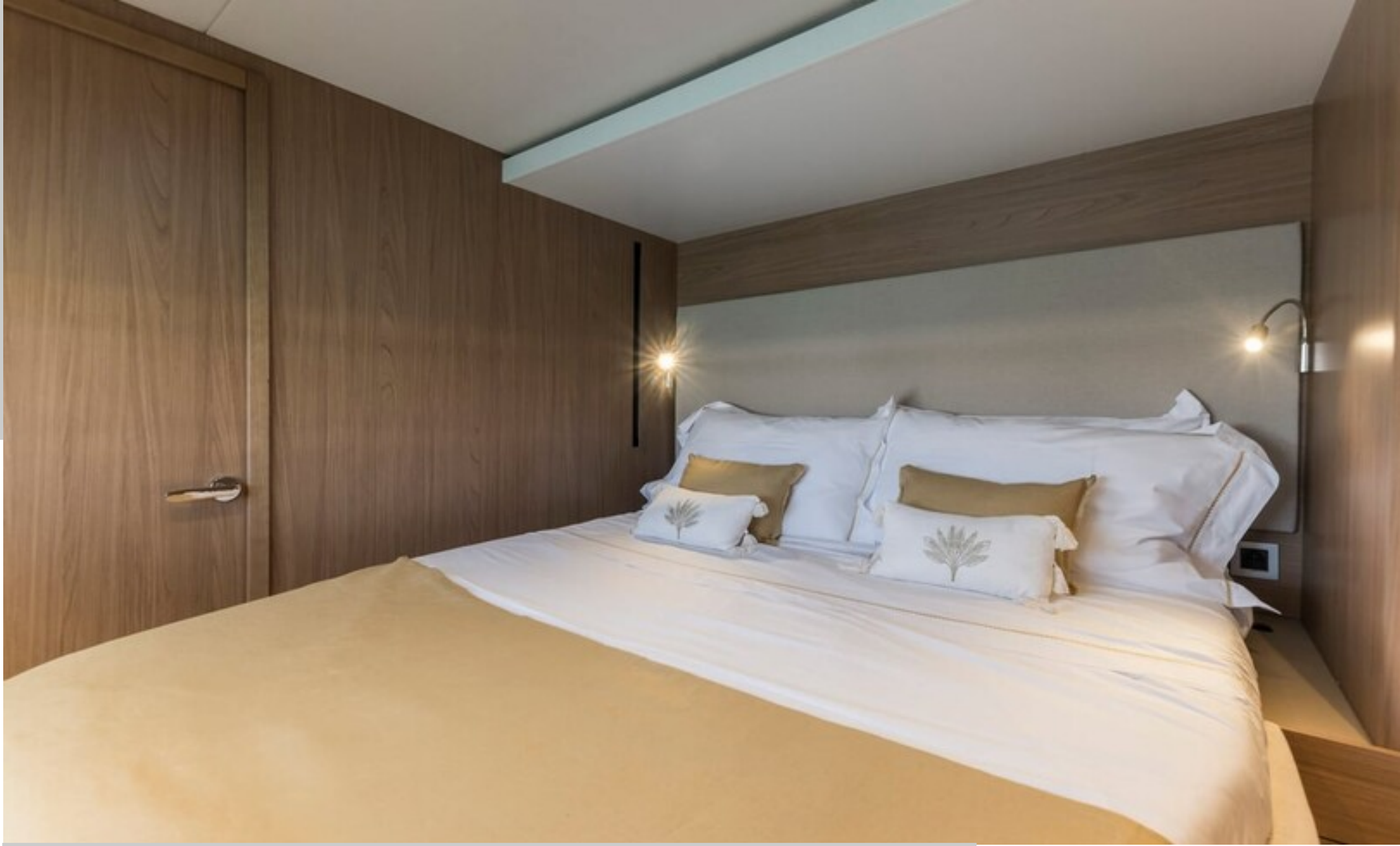
ALISEI BALI CATAMARANS