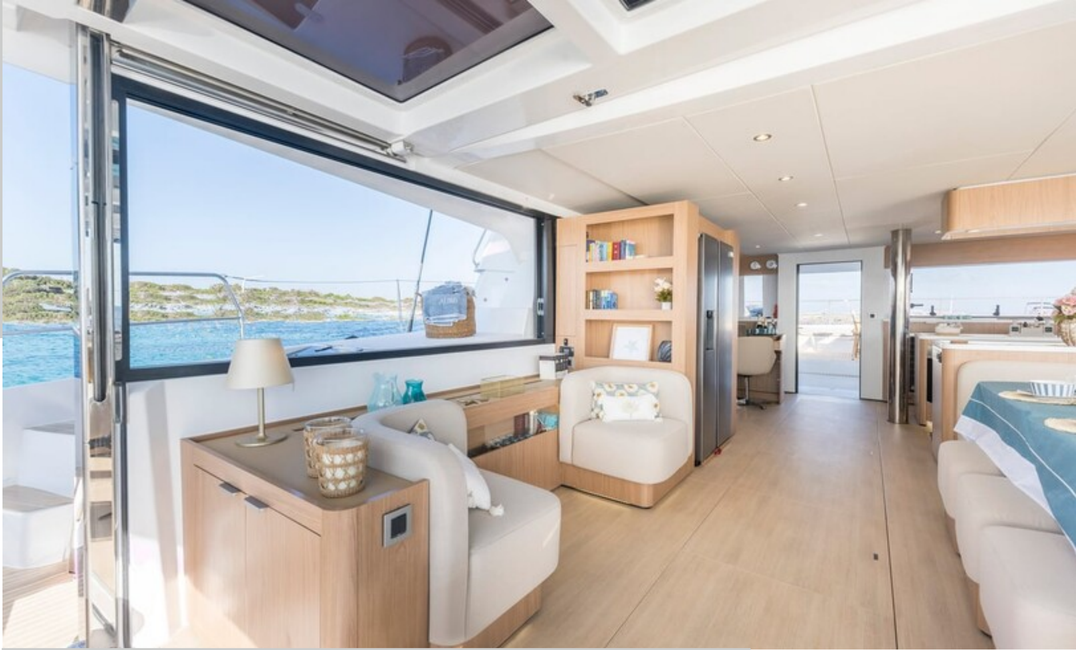
ALISEI BALI CATAMARANS