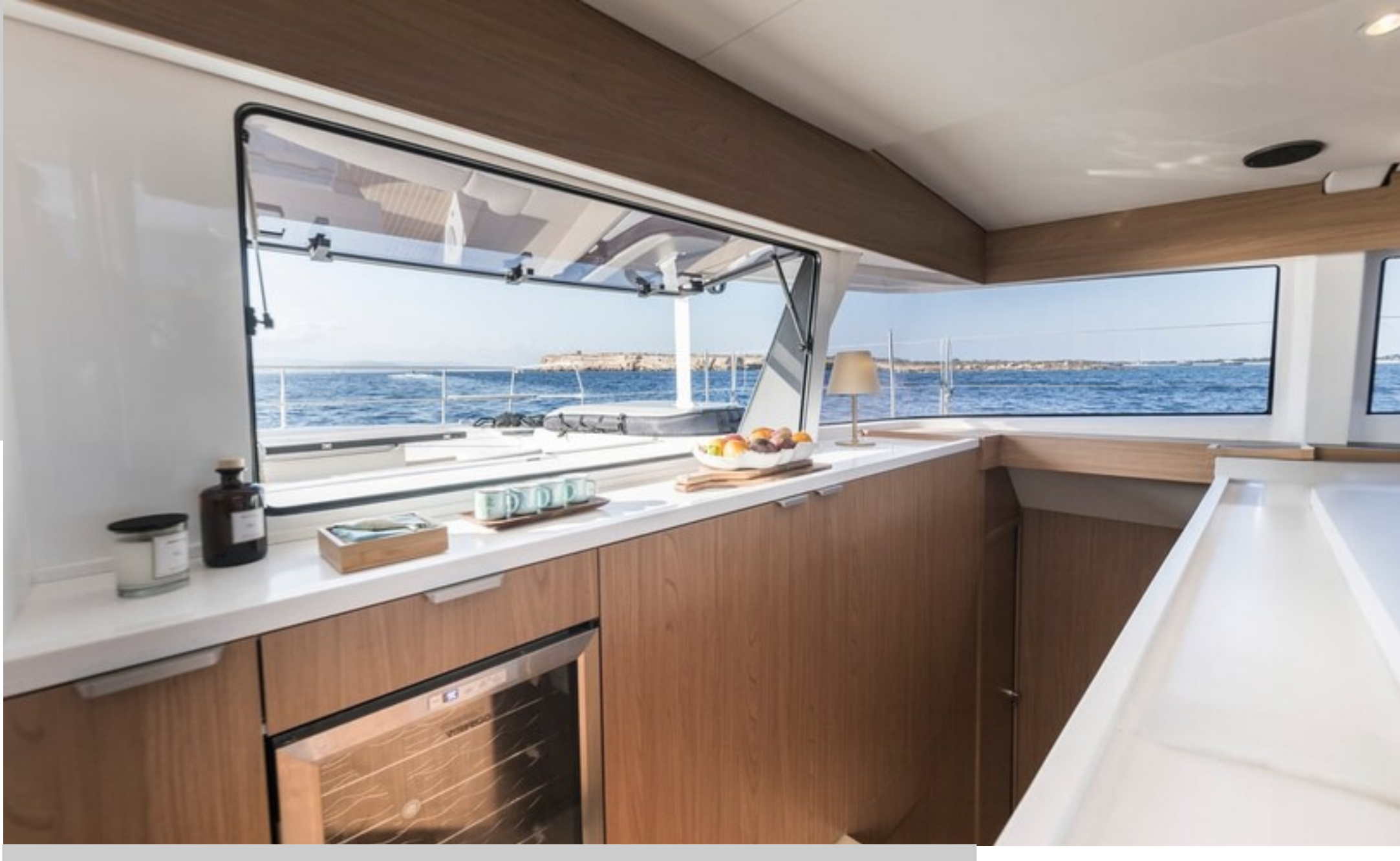
ALISEI BALI CATAMARANS