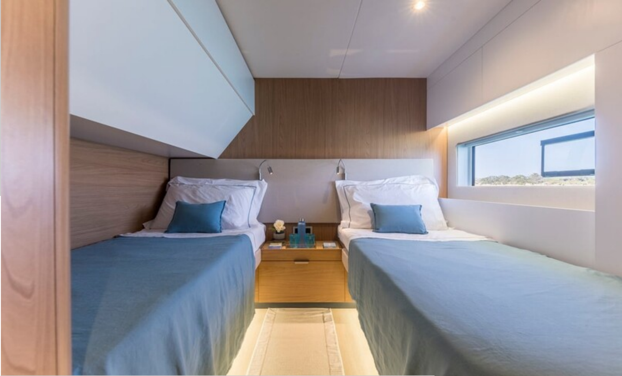
ALISEI BALI CATAMARANS