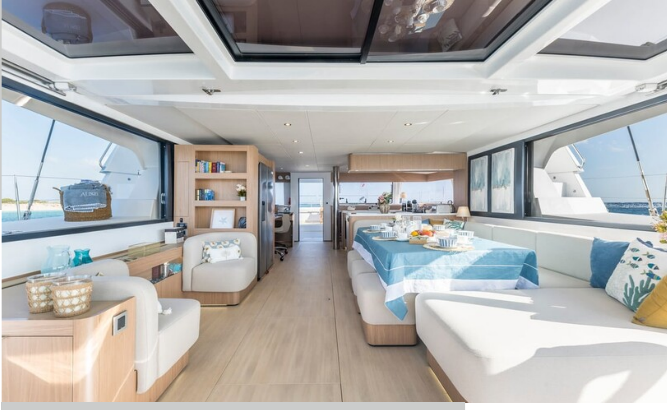
ALISEI BALI CATAMARANS