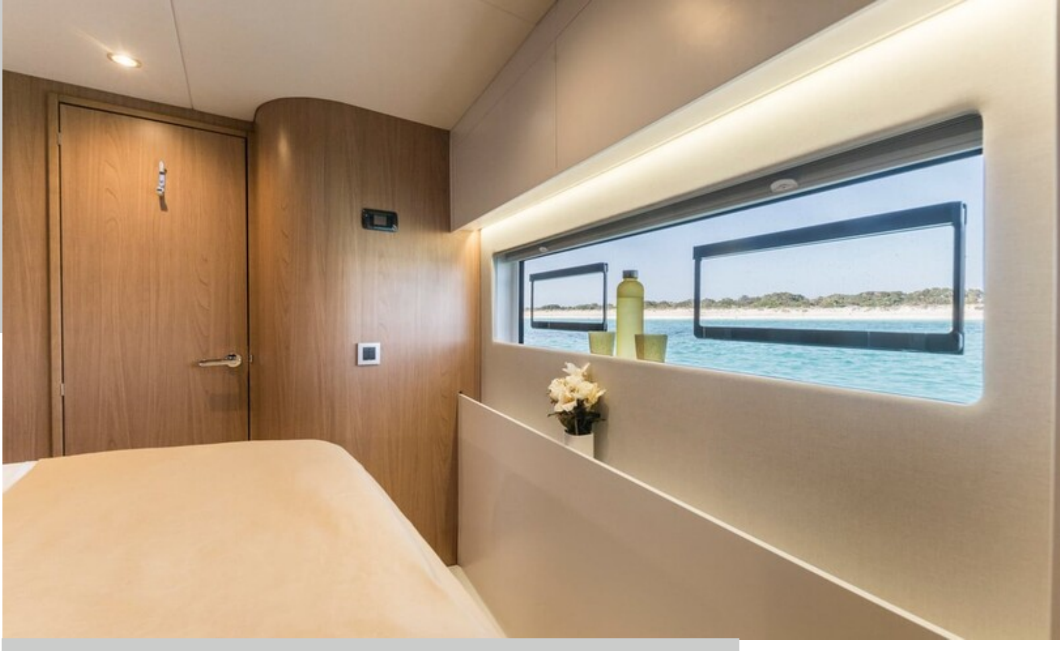
ALISEI BALI CATAMARANS