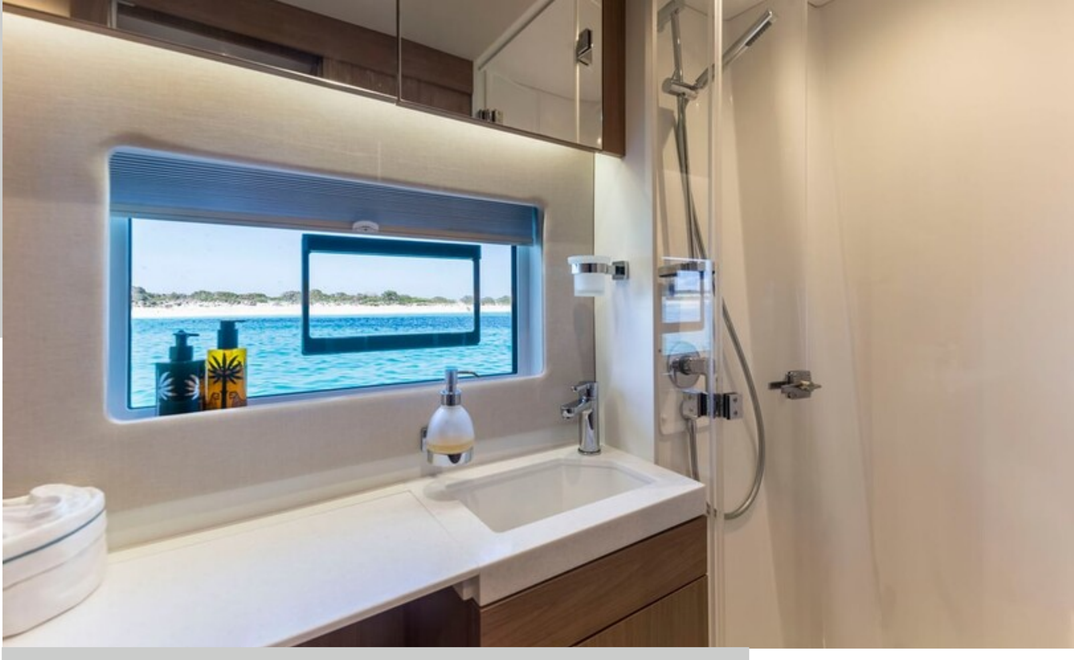
ALISEI BALI CATAMARANS