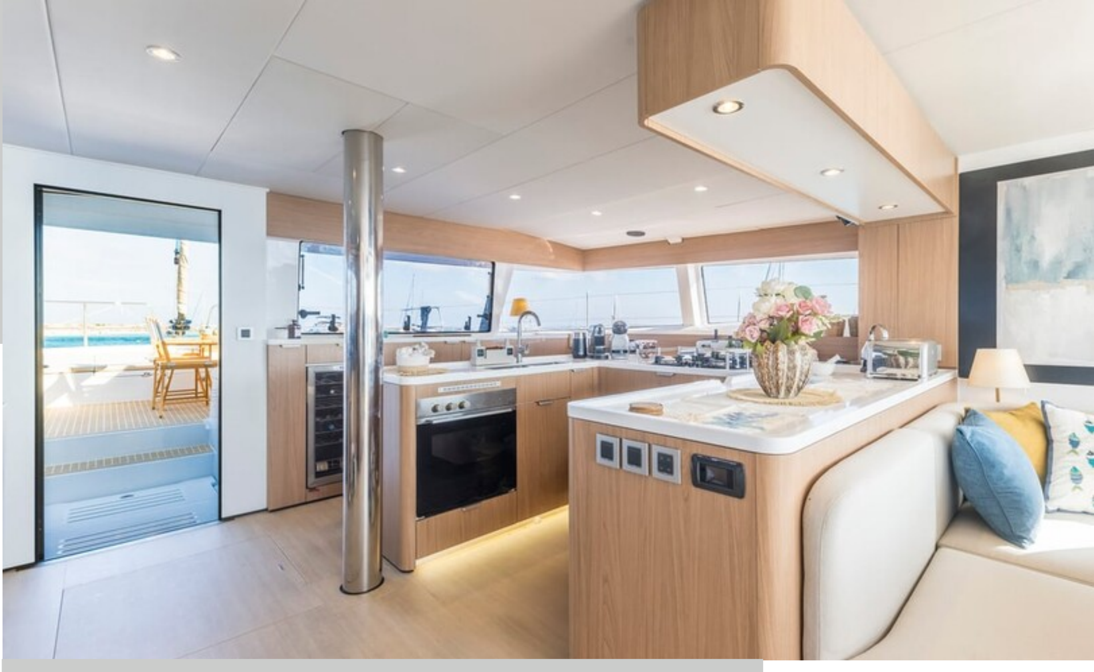
ALISEI BALI CATAMARANS