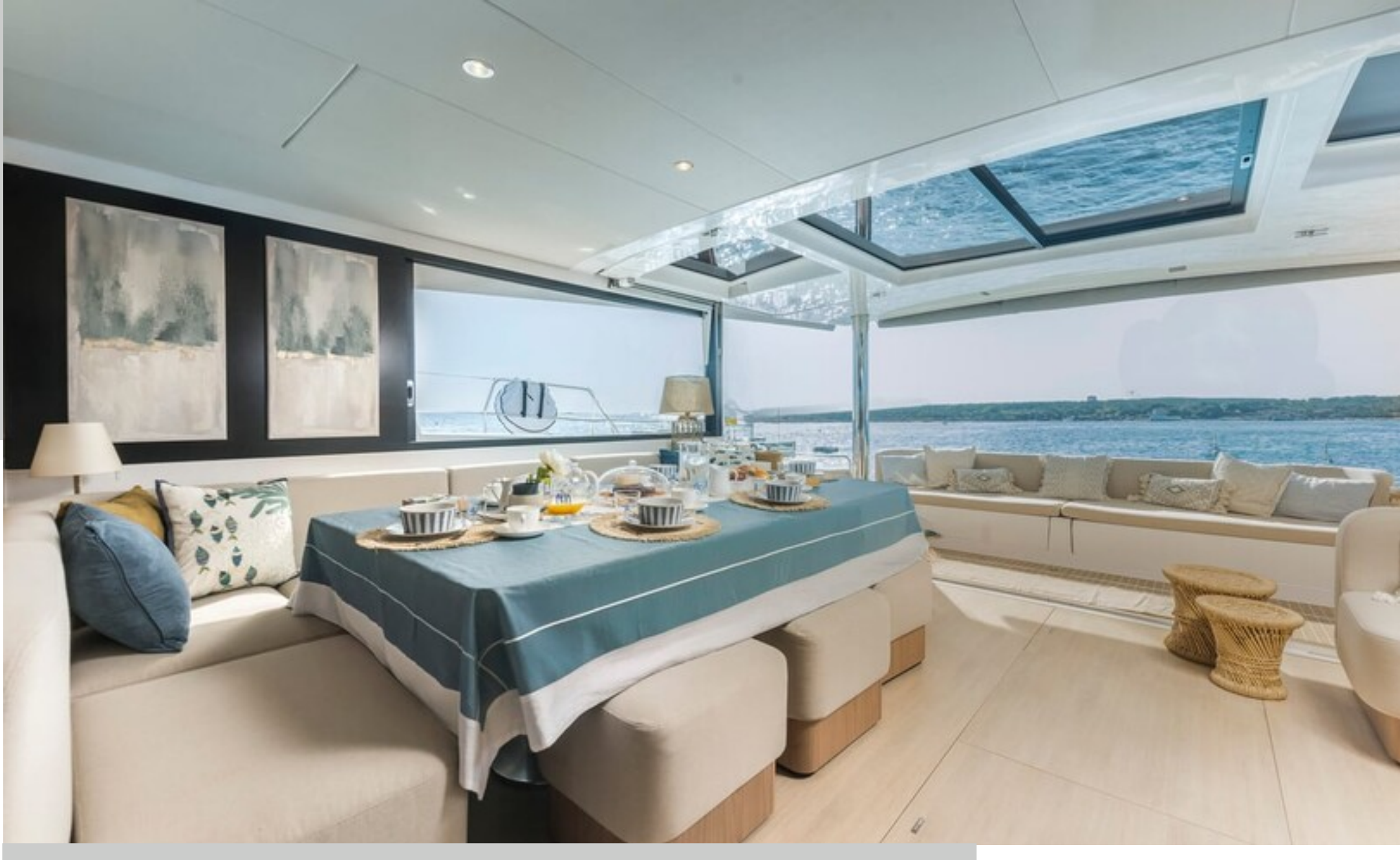
ALISEI BALI CATAMARANS