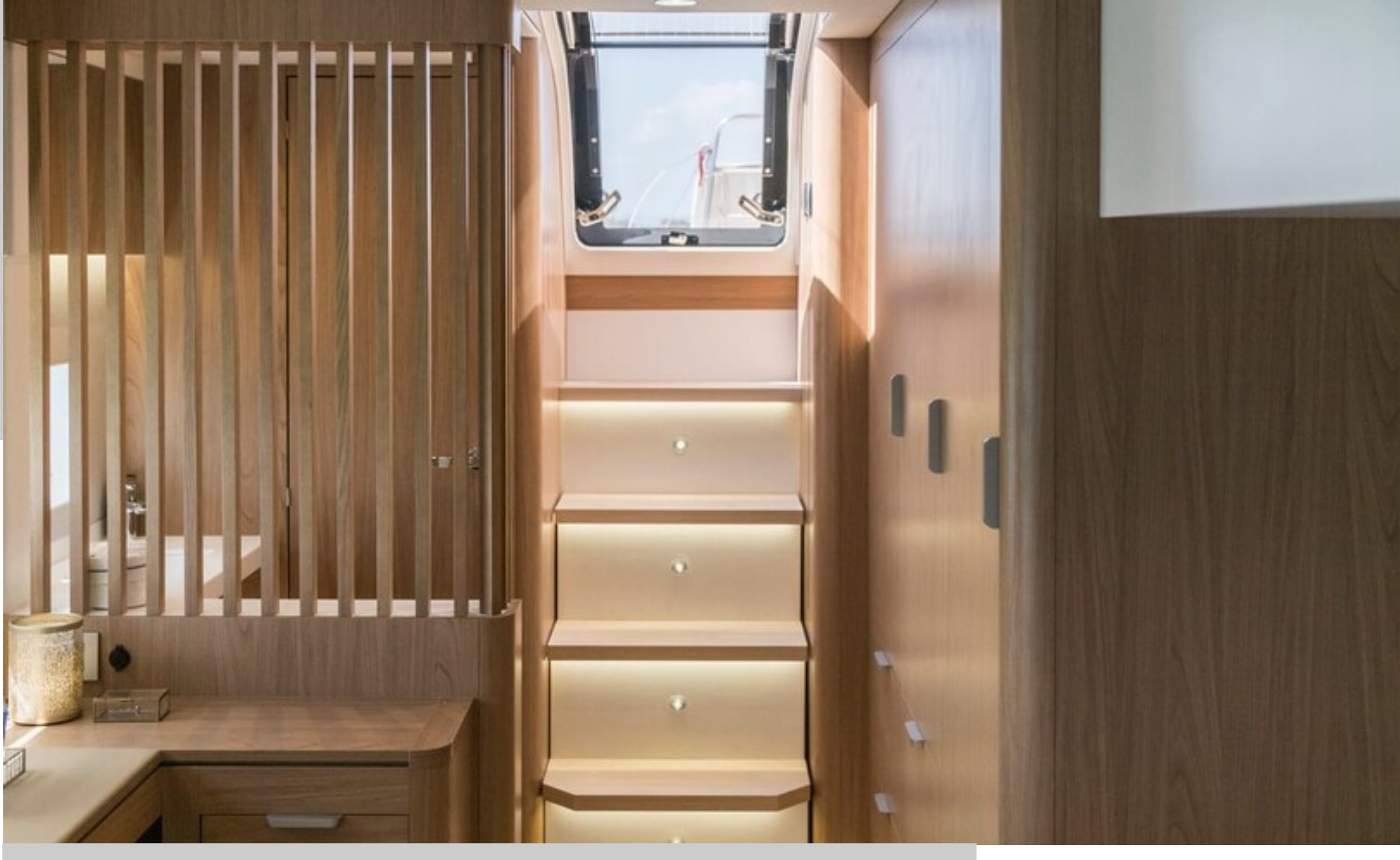
ALISEI BALI CATAMARANS