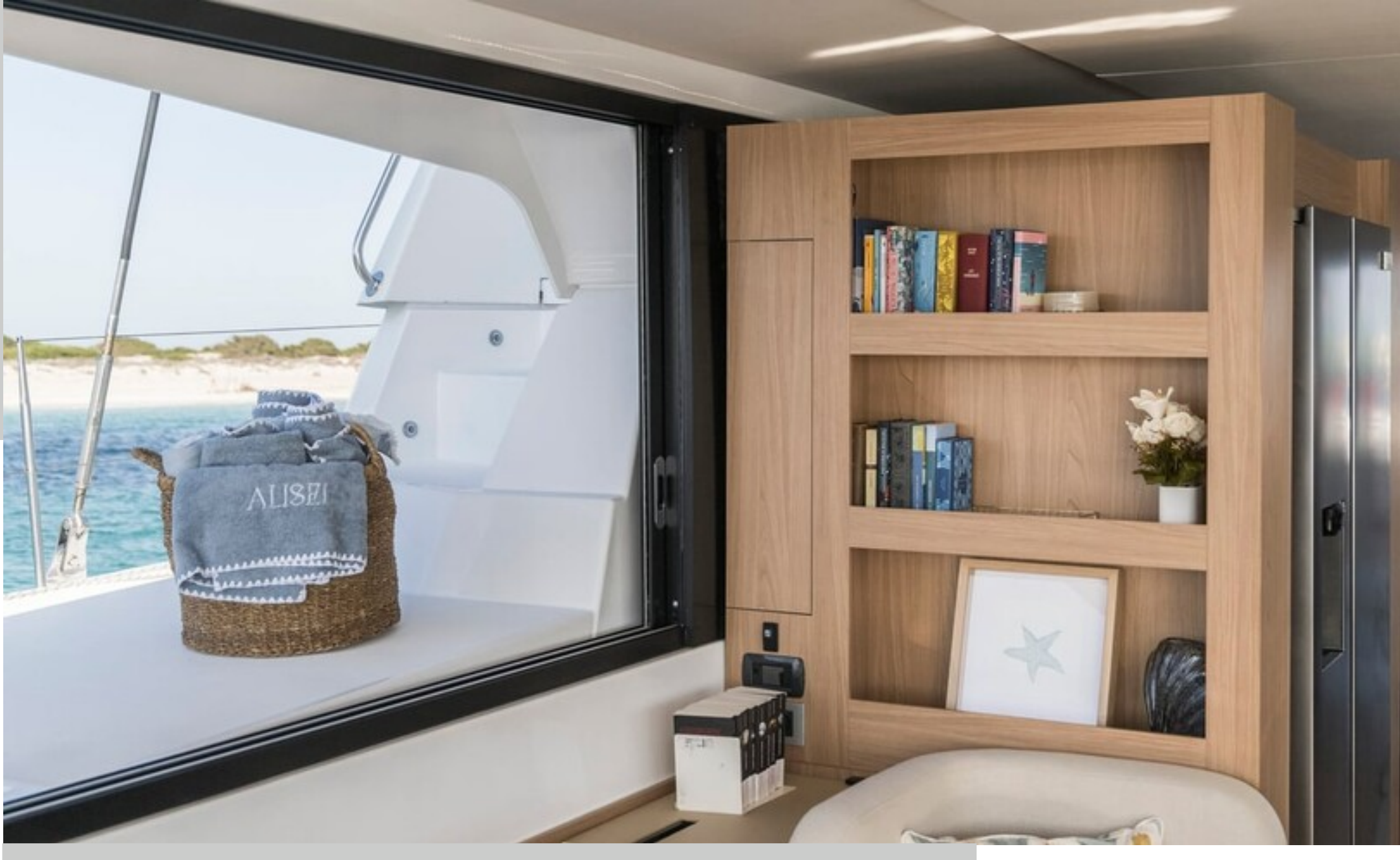
ALISEI BALI CATAMARANS