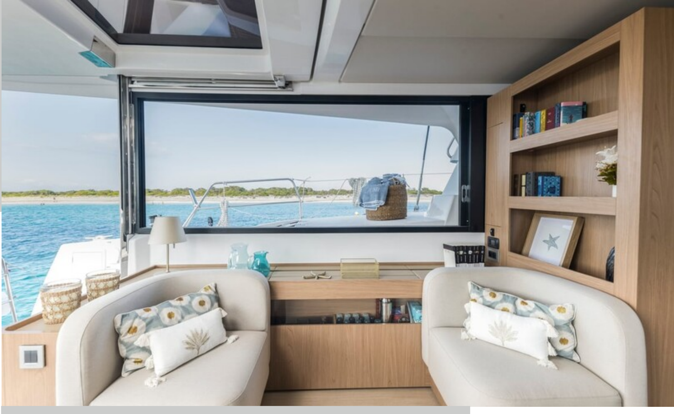
ALISEI BALI CATAMARANS