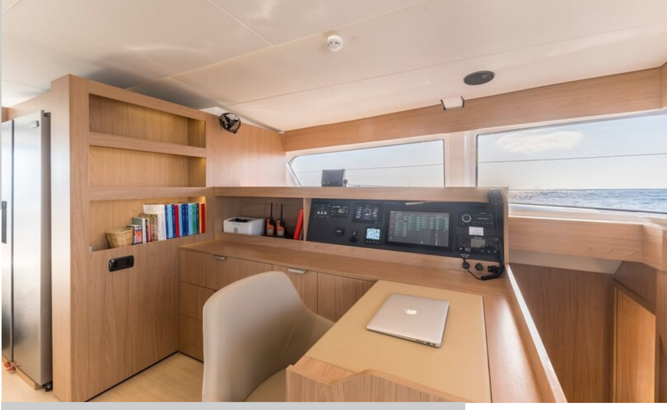
ALISEI BALI CATAMARANS