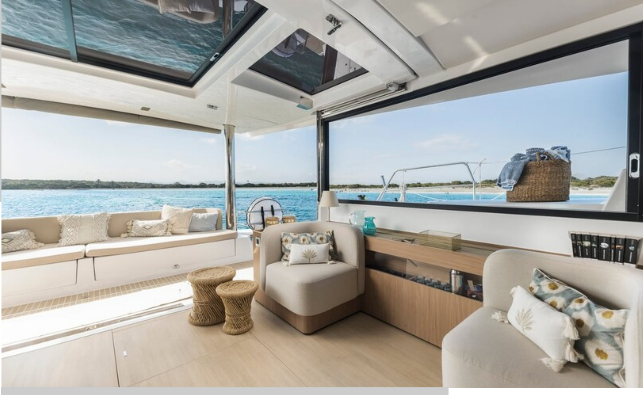
ALISEI BALI CATAMARANS