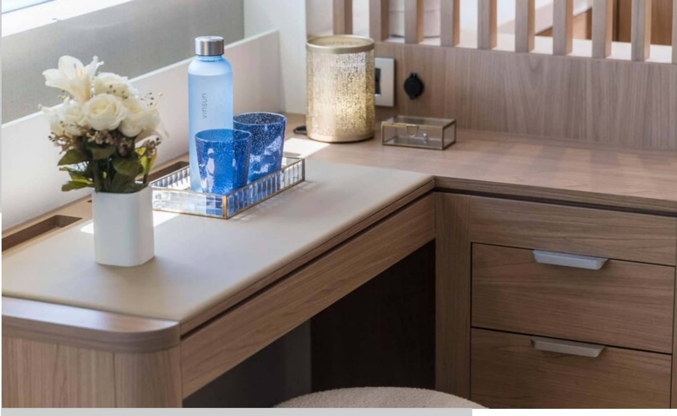
ALISEI BALI CATAMARANS