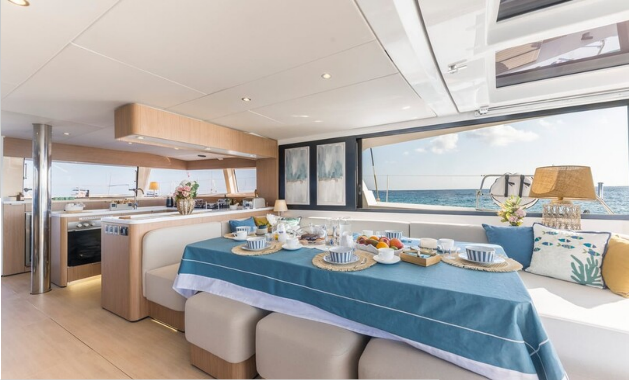
ALISEI BALI CATAMARANS